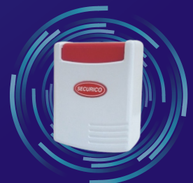
Panic Switch Economy