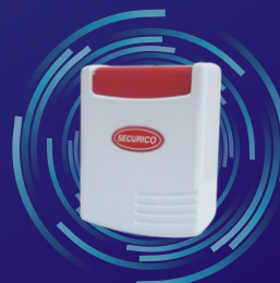
Panic Switch Economy